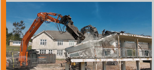
Benenden Hospital (£730k): The former hospital's buildings were demolished, including asbestos removal and slab clearance. Materials were crushed for reuse in later development.