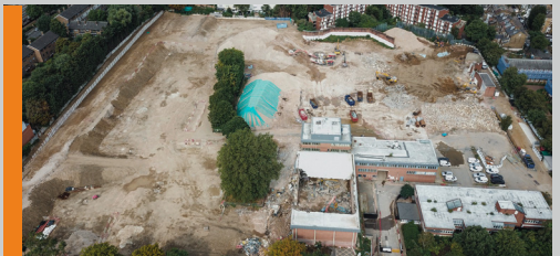
HMP Holloway (£3.7m): The former estate, with buildings from two to five storeys, underwent full demolition including asbestos removal and slab clearance. Materials were crushed for reuse in later project phases.